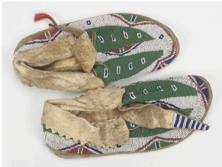
Moccasins, Lakota, ca. 1890. (23/0695)