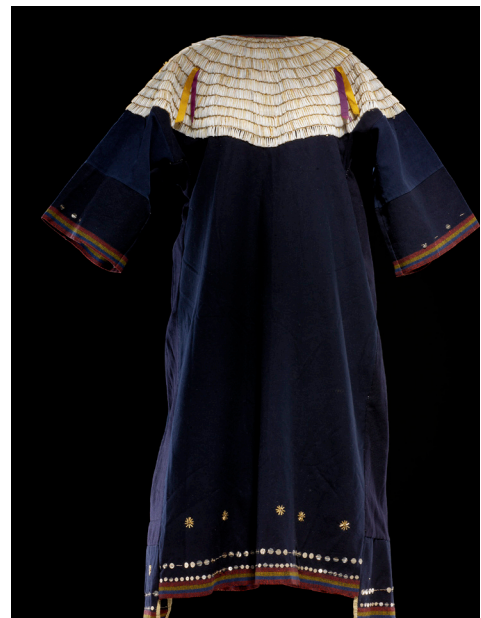
Woman's dress shown at right, Sicangu Lakota (Brulé Sioux), ca. 1880. South Dakota. Wool cloth, glass bead/beads, dentalium shell/shells, ribbon, sequins, thread. (21/969)

lady's dress in the drawing similar to or different from the dress shown at the right?