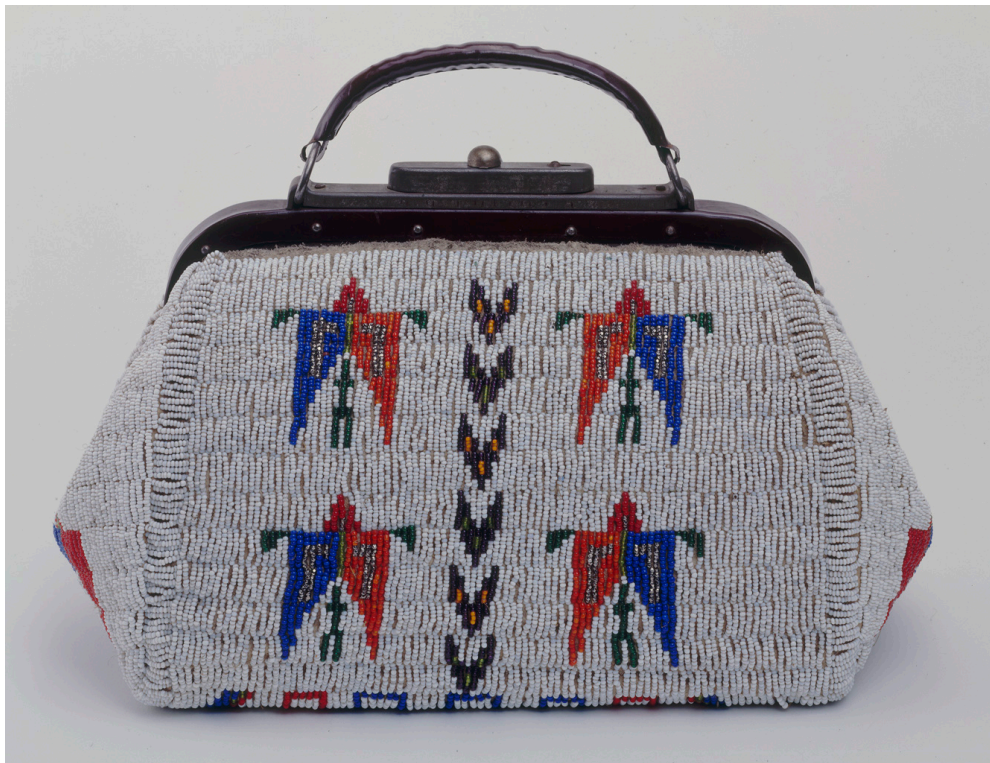
Pocketbook or doctor's bag, Lakota (Teton/Western Sioux), ca. 1890. North Dakota or South Dakota. Hide, metal items, glass bead/beads, metal bead/beads, twine/string. (25/982)