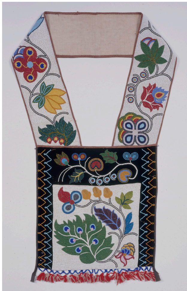
Bandolier bag, Ojibwe, 1880-1950. (23/2965)