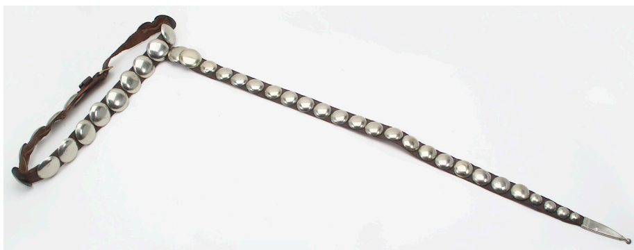
Belt, Lakota, ca. 1910. (02/5994)

The leather belt that the main figure in the drawing wears has silver discs. What else do you notice about the belt?