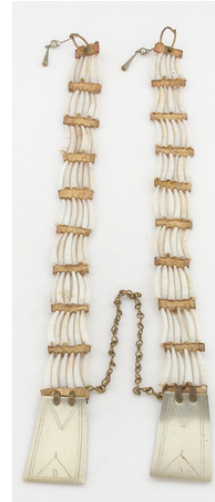
Shown at right, Earrings, Oglala Lakota, 1883. (15/0147)