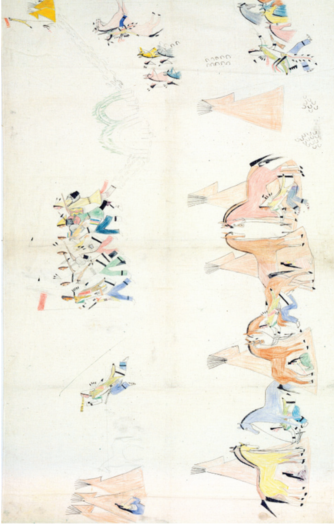
Painted muslin by His Fight (Hunkpapa Lakota) depicting a horse raid against the Apsálooke (Crow), ca. 1880. South Dakota or North Dakota. National Museum of the American Indian. (6/7932)