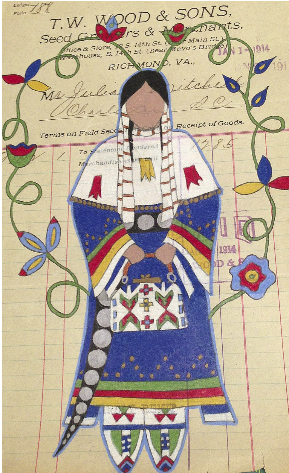
In the Moment by Avis Charley (Dakota/Diné), colored pencil.