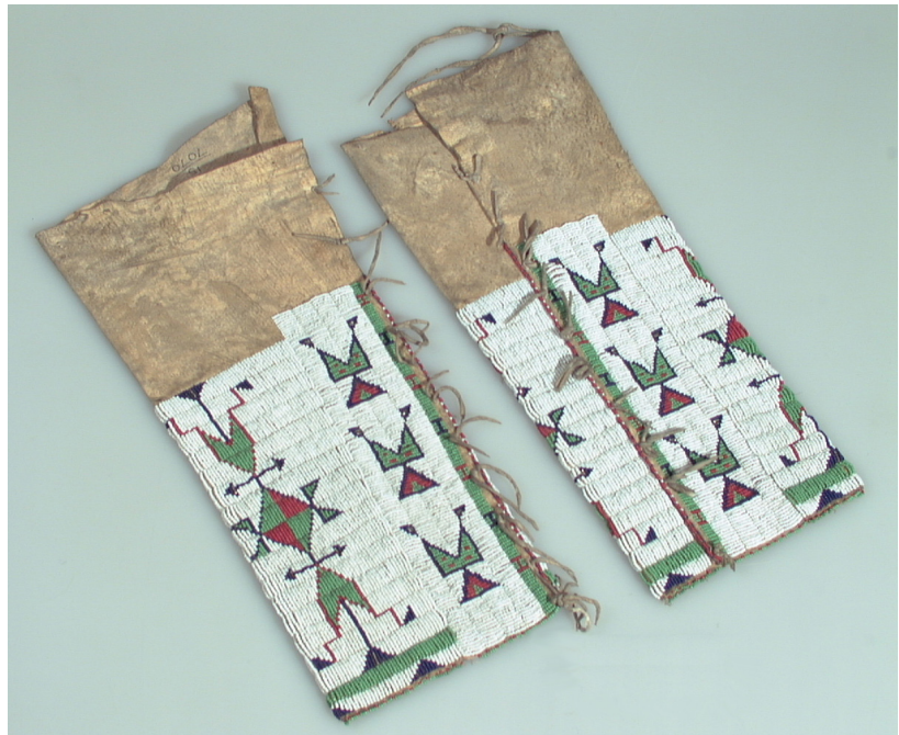
Leggings, Oglala Lakota, ca. 1890. (15/7070)